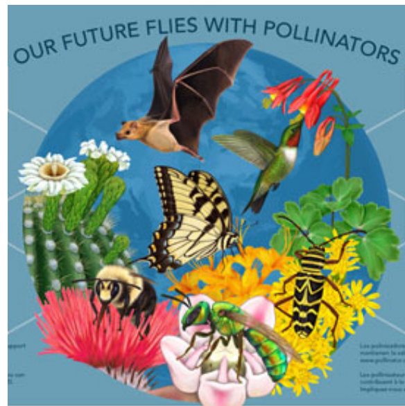
“Our future flies with pollinators”, 2020 Pollinator Poster Credit: Fiorella Ikeue

FRCOG will utilize virtual public meetings of the working group to share draft maps and other working materials of the plan for stakeholder review. We look forward to the meaningful and inspiring discussions full of community-driven ideas for ways to establish pollinator habitats and corridors across Franklin County communities and to link corridors with neighboring towns.